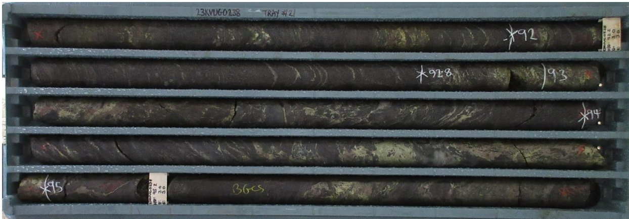
Figure 2 Cu-Au mineralisation in 23KVUG0238 through the Spitfire Lode