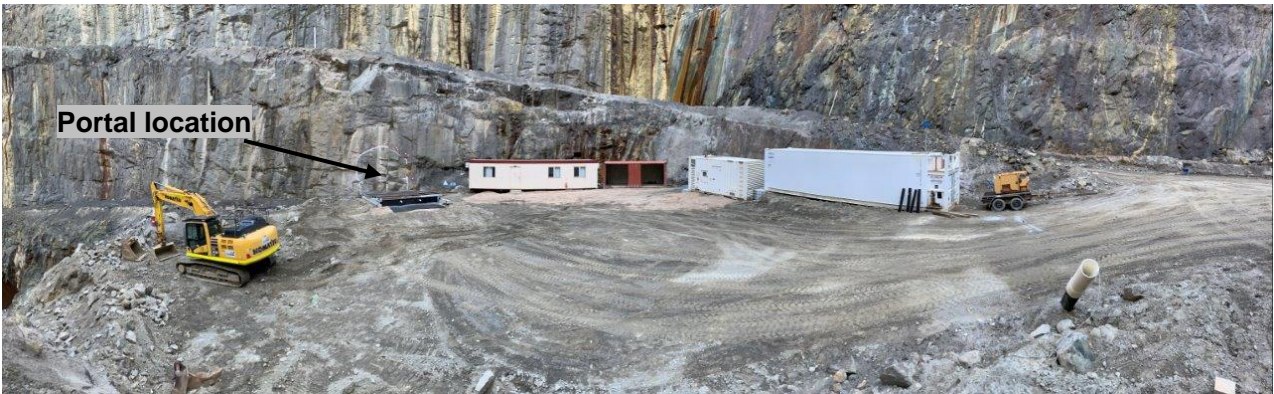
Figure 3 Bringing the genset to the portal location