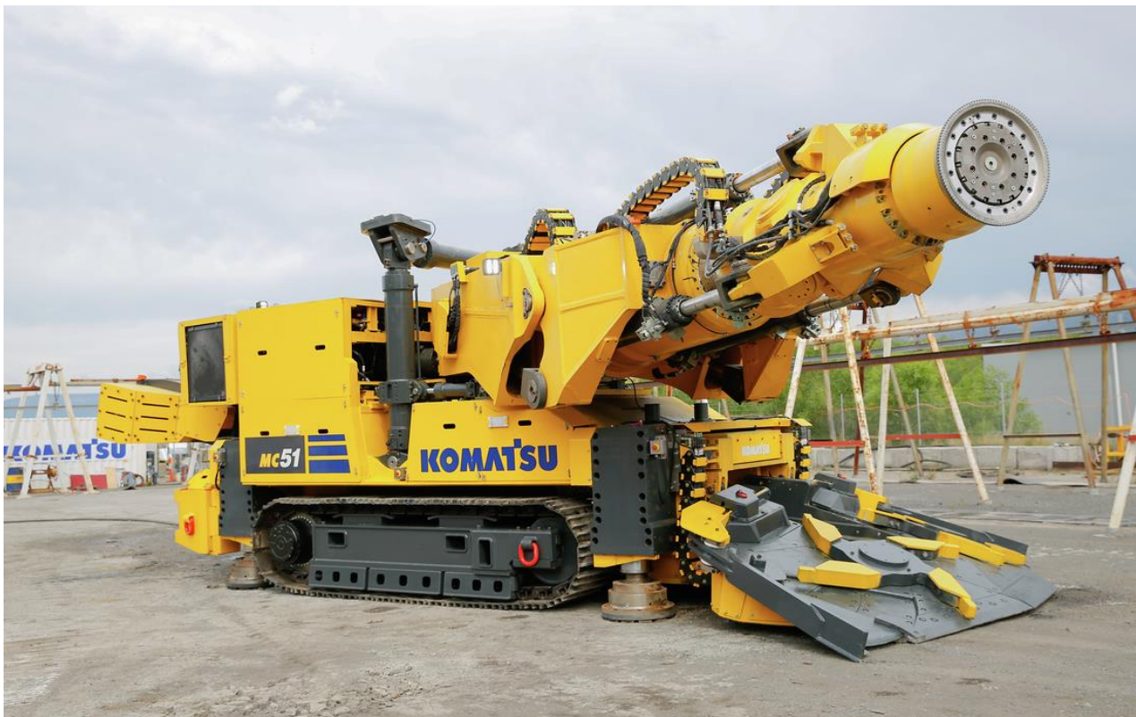
Figure 1 Komatsu MC51

“We’re excited to be trialling this new machine and technology because it offers the potential to really change the way our customers mine.”