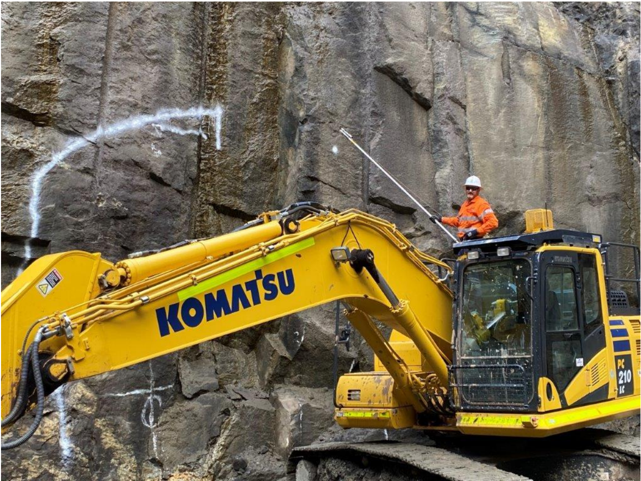
Figure 5 Preparing portal for Komatsu MC51