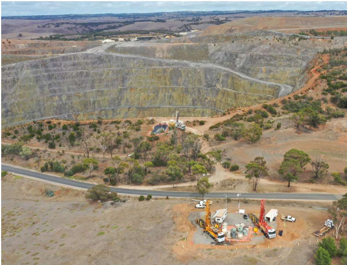
Figure 1: three drill rigs in operation

Figure 1 shows the three drill rigs in operation at the north-eastern end of the open pit, with the image looking south-west across the Giant Pit and towards Hillgrove’s copper processing facility.