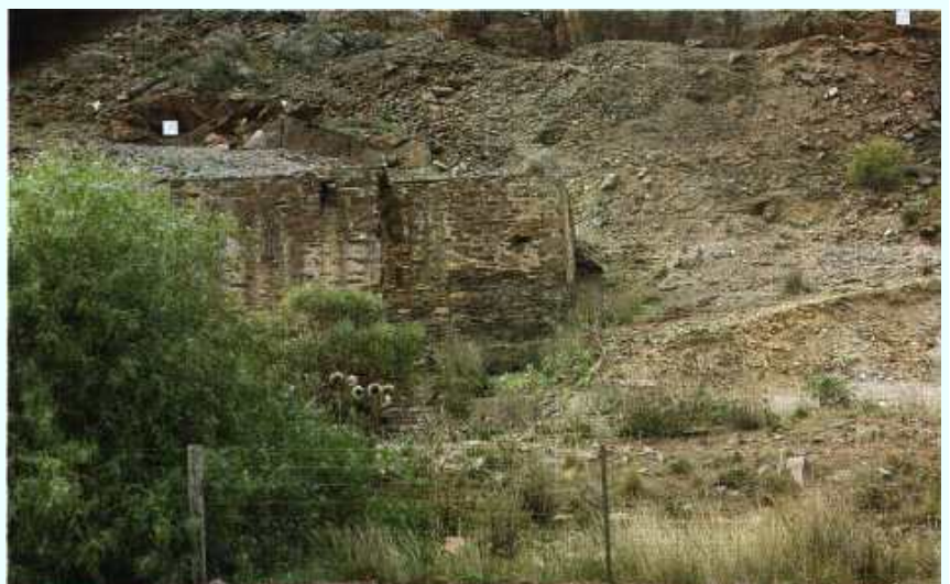
Mining first started at Kanmantoo in the 1840s. There are still some relics of past incarnations, including the remains of a 19th-century smelter