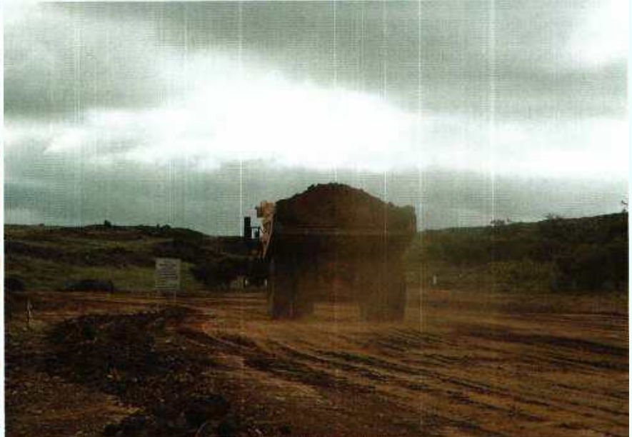
Mining contractor Exact Mining is currently hauling clay up to the tailings facility

“The first stage will see 5,000m of drilling to upgrade inferred resources and we will then target some of those prospects outside of the current resource with a further 2,500m. It is relatively easy exploration. The deposit is still open at depth and along strike and it is a matter of following the mineralisation along the ridge line.”