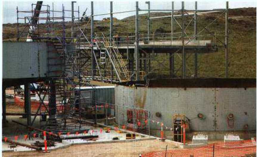
Hillgrove acquired the Pillara base metals processing facility from the Lennard Shelf JV (Xstrata/Teck Resources) in August 2009

"There has not been a lot done on the exploration front since 2008 as focus was on taking