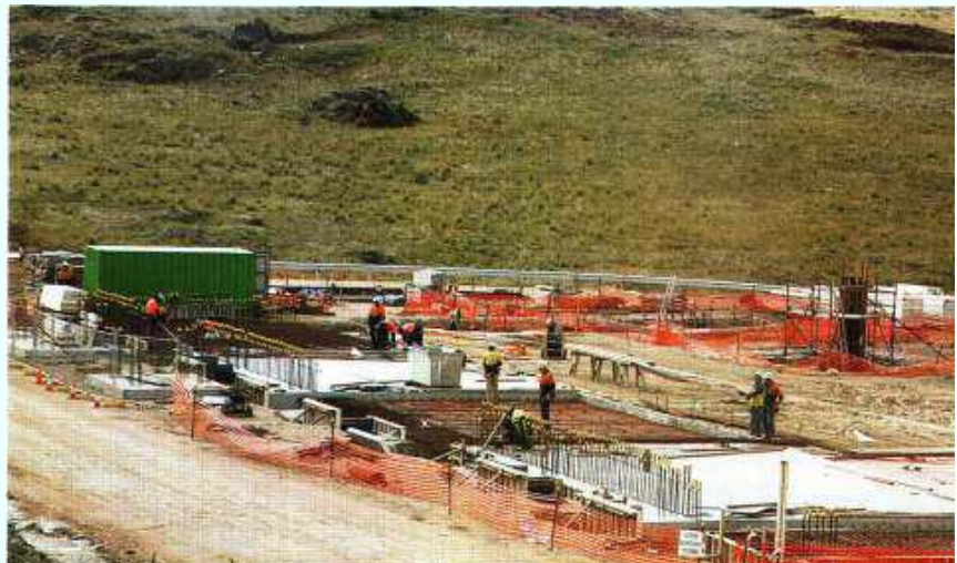
Construction of the concentrator area at Kanmantoo. The project is expected to produce 21,000 tpa copper, 9,000 ozpa gold and 177,000 ozpa silver from the beginning of 2012