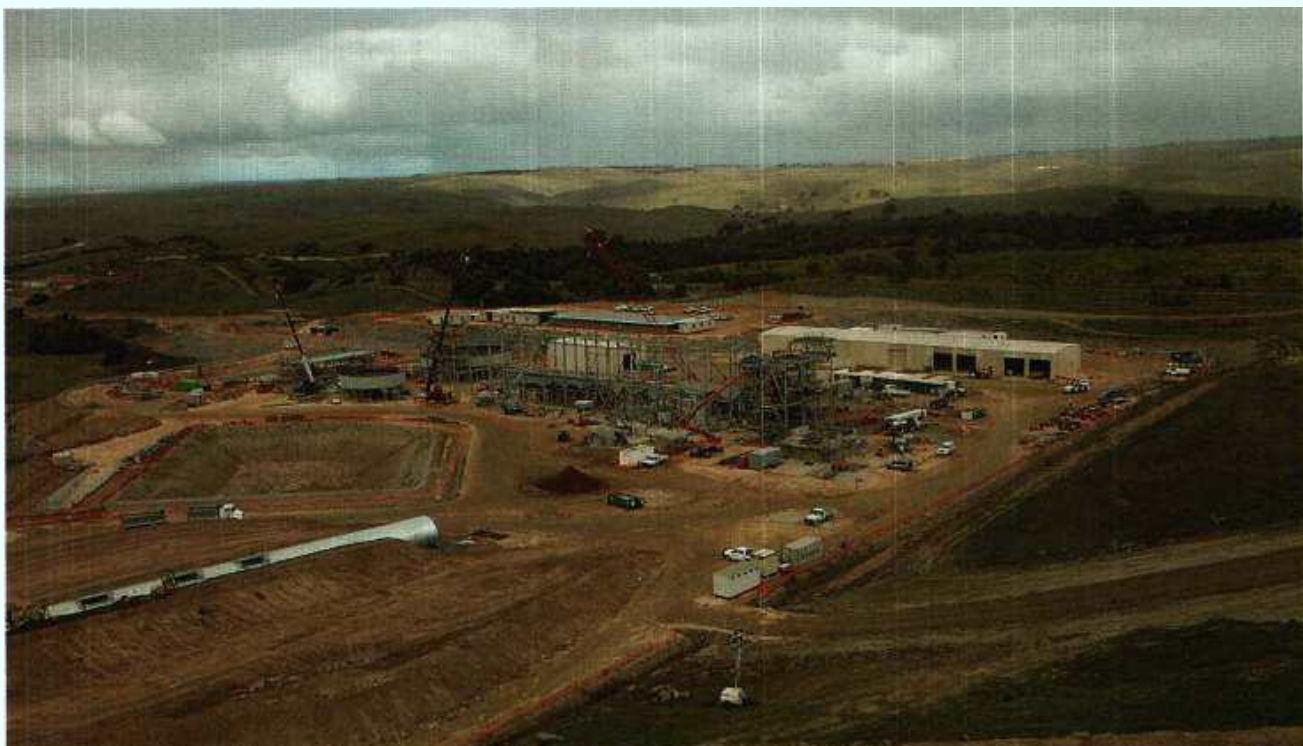
General construction at Kanmantoo is expected to be completed by September with production starting in November