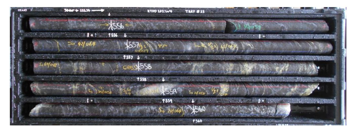
Figure 3 Cu-Au mineralisation in KTDD202_W4 in Kavanagh from 555.74m to 560.32m The interval 557 to 560m is an average of 3m @ 2.23% Cu, 0.19 g/t Au.

Figure 3 provides an example of the Cu-Au mineralisation in KTDD202_W4 in Kavanagh at a depth of 500m from surface. The vein chalcopyrite-pyrrhotite is hosted in a garnet and alusite biotite schist. Note the excellent core recovery.