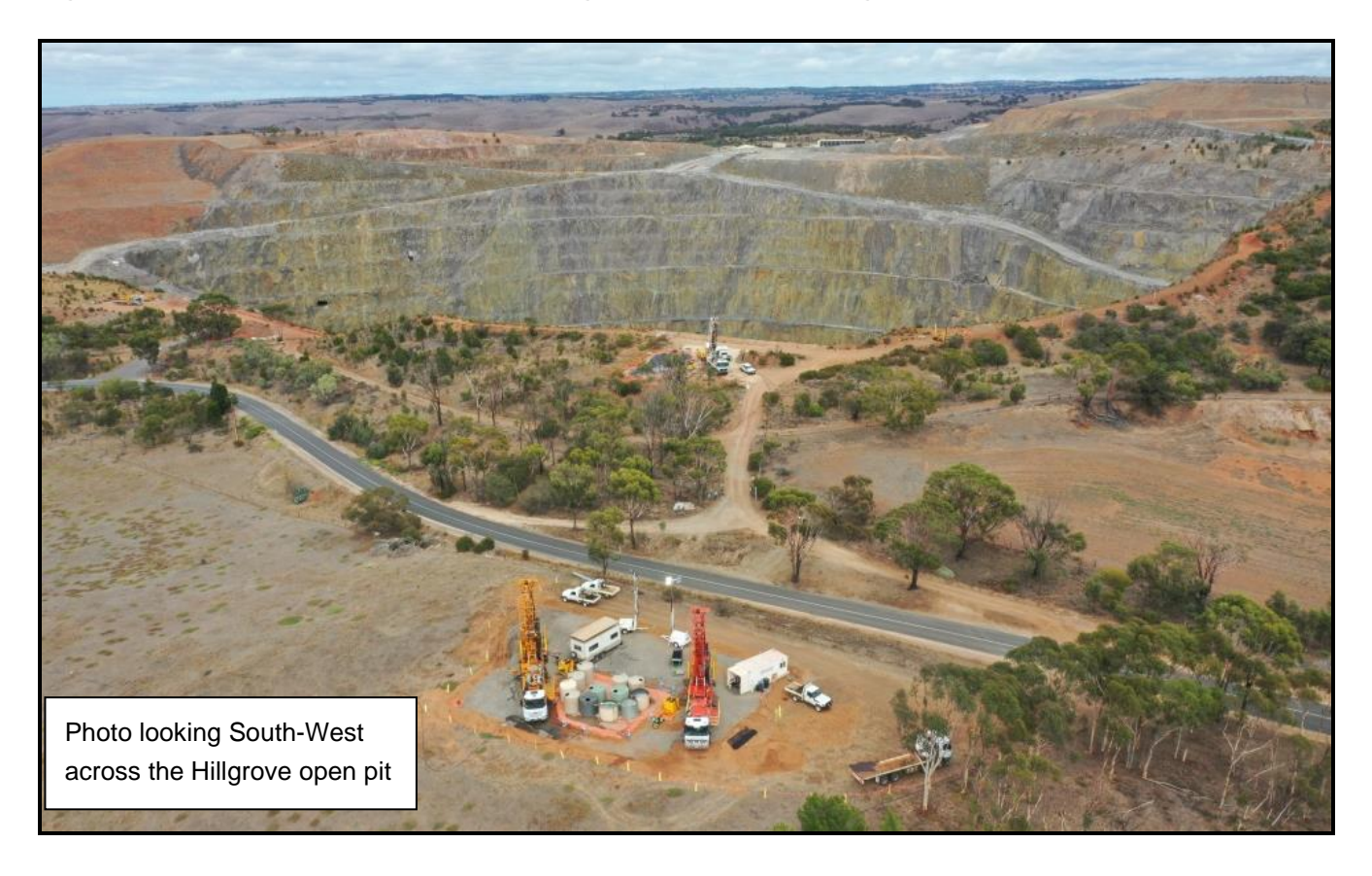
Figure 2 Location of Diamond Drilling – Aerial View looking south-west

Various samples have been collected for metallurgical assessment, in particular to assess the possibility of improving the gold recoveries. This work is in progress.