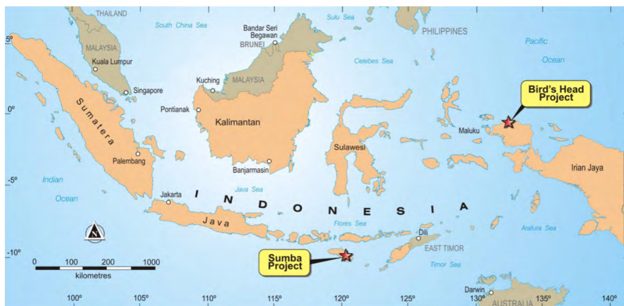
Figure 2: Project Location Map

HGO's exploration assets in Indonesia offer significant exploration potential, and there is next to no value in the share price for these two projects.