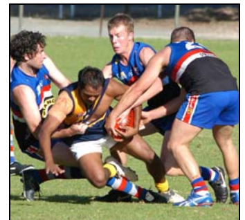
Callington United Eagles Vs Macclesfield

I have previously held similar roles in the start up of new mines at; Tick Hill with MIM in Queensland, Benambra Mine with Denehurst in Victoria, as well as recommencement of operations at old mines at Mount Magnet with Hill50Gold in WA and at Mount Gordon with Western Metals in NW Queensland. This role is my first mining related job in South Australia which is my home state.