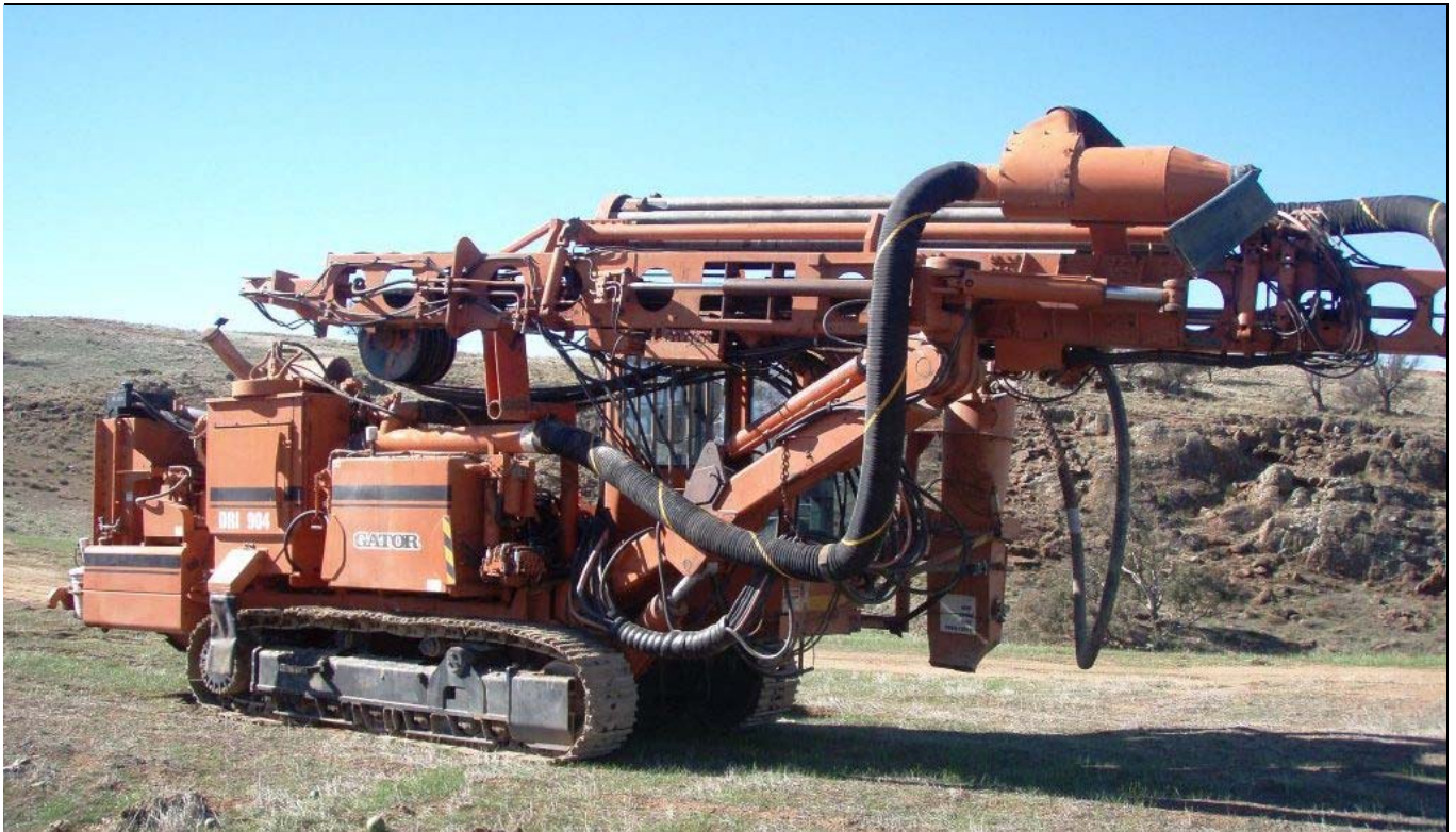
Track mounted, Tamrock Gator RC drill rig