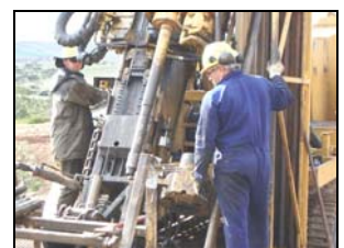
Contractor operating drill rig

During June it will be business as usual with Hillgrove and the independent consultants continuing work on the DFS. Whilst this work is under way drill rigs will be visible from time to time from both Mine Road and Back Callington Road.